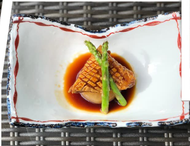
Grilled Burikama with Japanese pepper flavor sauce