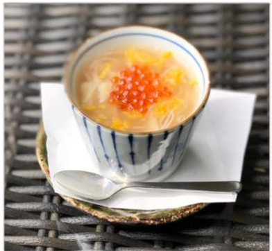
Lotus root and Mochi Thick sauce

From March 1st to May 31th 7 COURSE $100+TAX