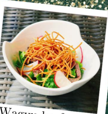
Wagyu beef with Crunchy soba Salad

*Please make a reservation at least one day in advance. *If you have any allergies, please let us know when you make your reservation. *This course is only for dinner and only dine in. *The menu is subject to change depending on availability.