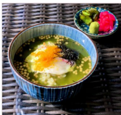
Cherry bass Chazuke with Karasumi