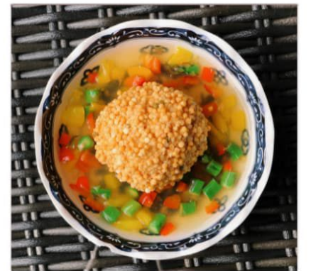
Seasonal potato Manju